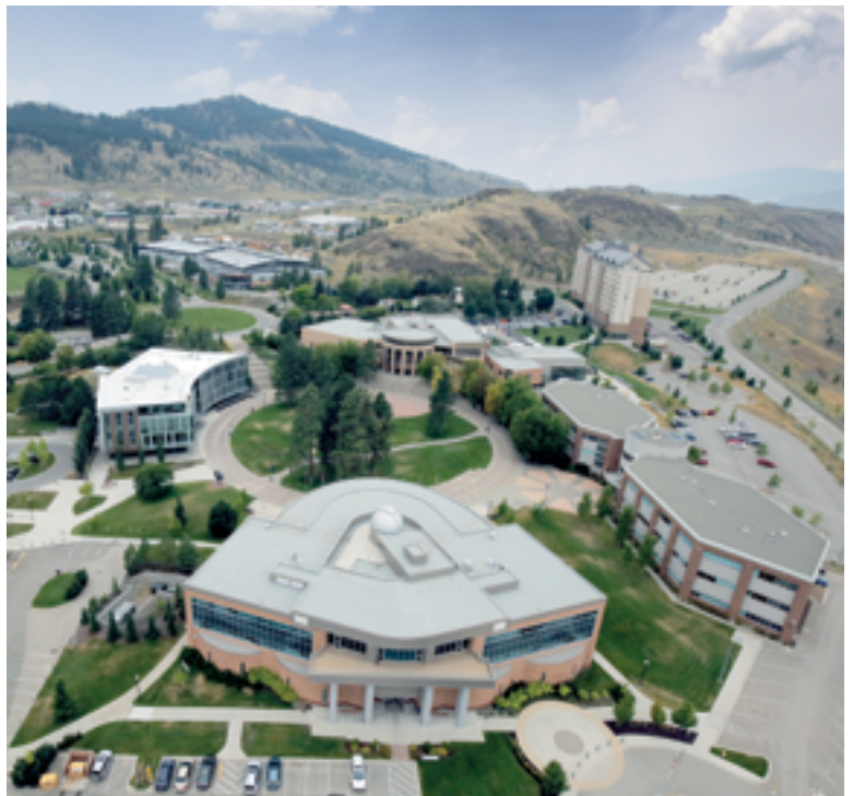
TRU Campus, located in the heart of Kamloops

For over 25 years, Thompson Rivers University (TRU) has been delivering customized training programs of the highest calibre, earning us worldwide recognition. Our intensive, short-term programs are strategically balanced to maximize learning opportunities while allowing participants enough time to gain an appreciation of Canadian culture and participate in carefully selected activities. The result is a rich and rewarding experience that will last a lifetime.